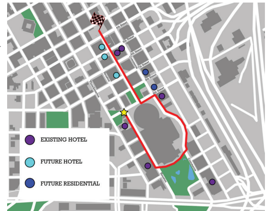
Night walk route - February 2019

A subcommittee of the PID Advisory Board was created to identify Downtown enhancement opportunities for public spaces and the pedestrian environment. The group walks various downtown routes at different times of day, looking at our district through the lens of a visitor, resident, worker, or any Downtown user. Over the last year, the PID Work Plan committee has identified signage opportunities, landscaping, public art, sidewalk enhancements and lighting improvements to be