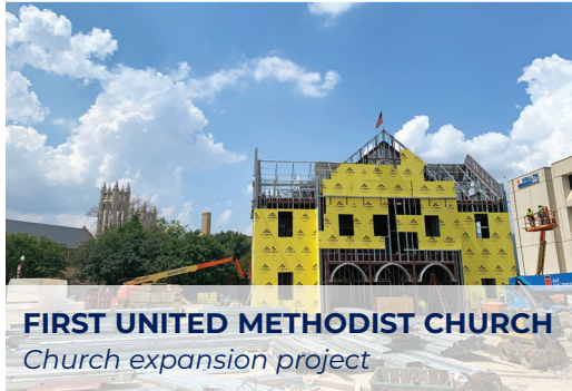
FIRST UNITED METHODIST CHURCH Church expansion project

Downtown development is on the rise! Check out these projects that have moved out of the planning phase and are now under construction!