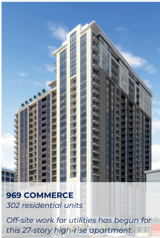
969 COMMERCE 302 residential units

Off-site work for utilities has begun for this 27-story high-rise apartment.