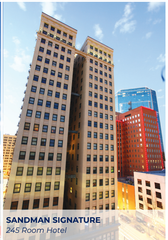
SANDMAN SIGNATURE 245 Room Hotel

Visit dfwi.org/projects for more information.